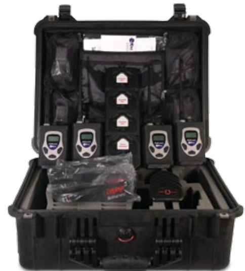
BioHarness Team Kit